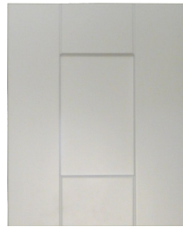
Euro White Shaker