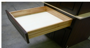
Deep drawers with under mount, Full Extension, Self Closing glides