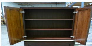
Concealed Doors Hinges, Interior matches exterior color